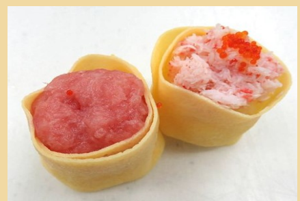
Ship Roll Sushi