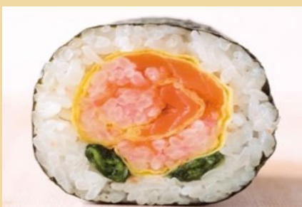
Sushi Roll Art (Rose)