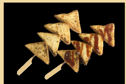
Fried Tofu Stick