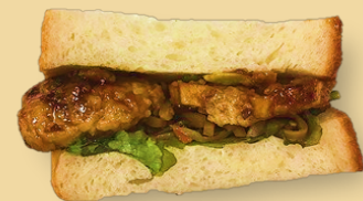
Sandwich w/h Chicken