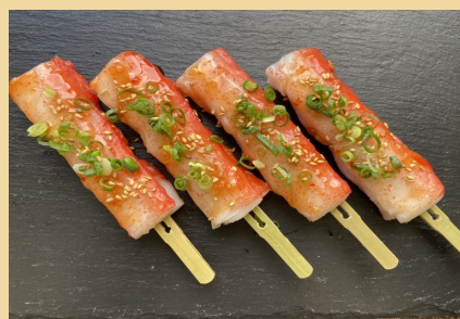
Crab stick skewers