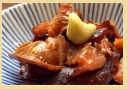
Appetizers w/ Wasabi