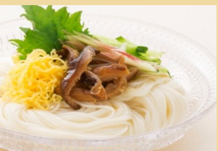
Cold Noodle Topping