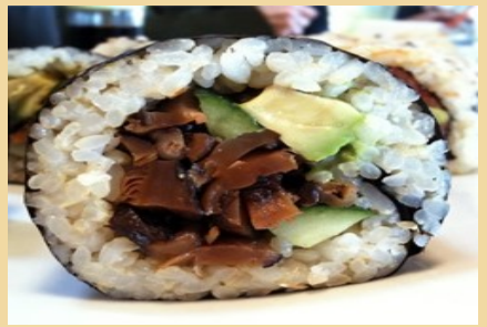
Vege Sushi Roll