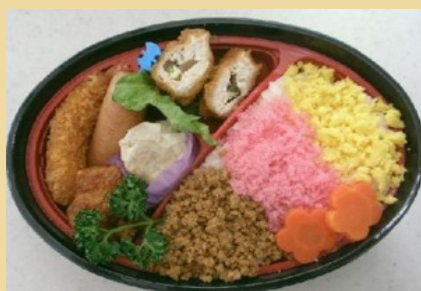
Three Color Bento