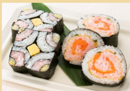
Mixing w/ Sushi Rice