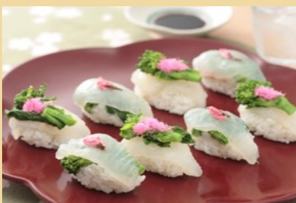
Topping Nigiri Sushi