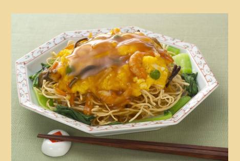
Deep Fried Noodle