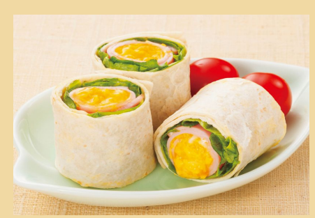
Ham Egg Tortilla