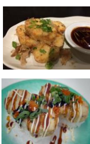
Fried Silken TOFU 冷凍絹厚揚げ