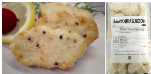
TOFU & FISH Nuggets ふんわり揚げ豆腐

Healthy side dishes mainly made of Tofu.