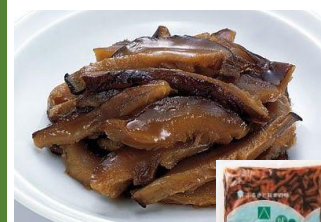
Seasoned Sliced Mushroom