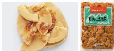
Bamboo shoot たけのこ土佐煮