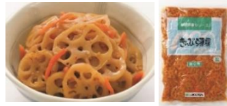
Lotus root きんぴら蓮根