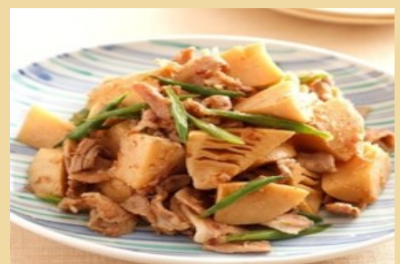
Saute w/ Chicken breasts