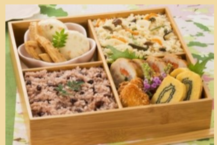
Rich Bento Box