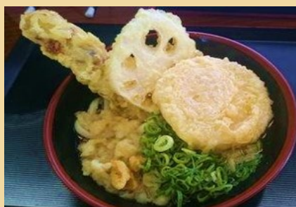
Topping for Udon