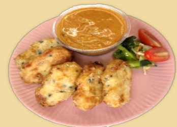
Nuggets with Curry Sauce